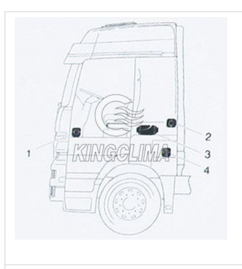
Example of the truck mounted position of parking air heater 1. The heater is installed at the foot of the co-pilot 2. The heater is mounted on the rear wall of the cab 3. The heater is installed under the